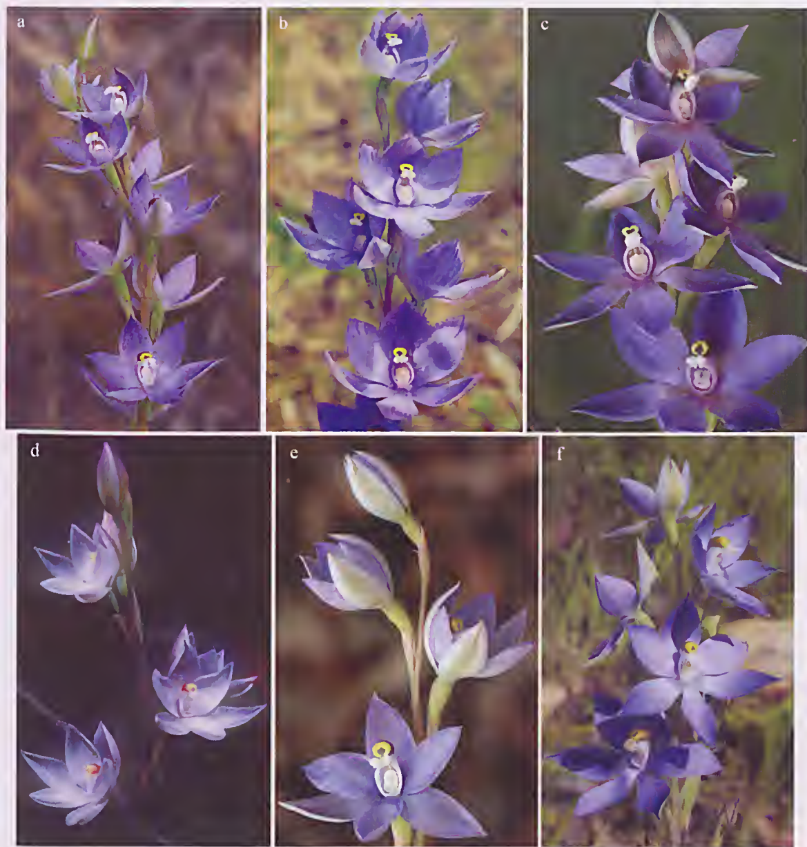
Figure 3. a. Thelymitra alcockiae , Tintinara, SA (photograph by J.A. Jeanes); b. T. imbricata , Campbelltown, Tas. (photograph by J.A. Jeanes); c. T. paludosa , Denmark, WA (photograph by A.P. Brown); d. T. nuda , Eaglehawk Neck, Tas. (photograph by J.A. Jeanes); e. T. graminea , Darling Ranges, WA (photograph by A.P. Brown); f. T. glaucophylla , Spring Gully C.P., SA (photograph by J.A. Jeanes)

Glabrous terrestrial herb. Tubers ovoid, 1–3 cm long, 5–12 mm wide, fleshy. Leaf linear to linear-lanceolate, 10–25 cm long, 5–12 mm wide, erect, fleshy, canaliculate, dark green with a purplish base, ribbed abaxially, sheathing at base, apex acute to acuminate. Scape 15–50 cm tall, 1.2–3.5 mm diam., slender to moderately stout, straight, green to purplish. Sterile bracts usually 2, rarely 1 or 3, linear to linear-lanceolate, 1.4–7 cm long, 3–9 mm